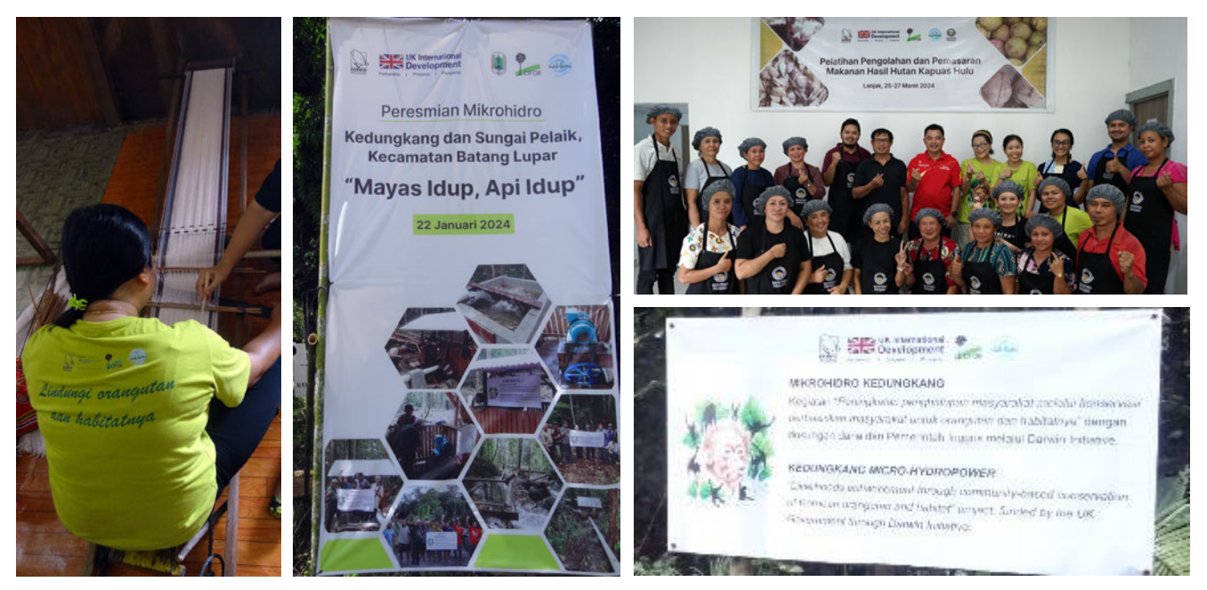
Fig. 3. We promoted and acknowledged Darwin Initiative and the UK Government, among others by putting the logos on banner of events and T-shirt.

In Kapuas Hulu, this project was the first funded by the Darwin Initiative. Stakeholders and beneficiaries were not familiar with the Darwin Initiative, until the project started. To familiarise participants and stakeholders, we promoted the project, Darwin Initiative and the UK Government in presentation, speech, articles, press release, project webpage and other media. The logos of Darwin Initiative and the UK International Development (and BMUB who contributed the matching funds) were presented on banner, communication outputs, and orangutan conservation campaign props such as T-shirts. See Fig. 2 and Fig. 3.