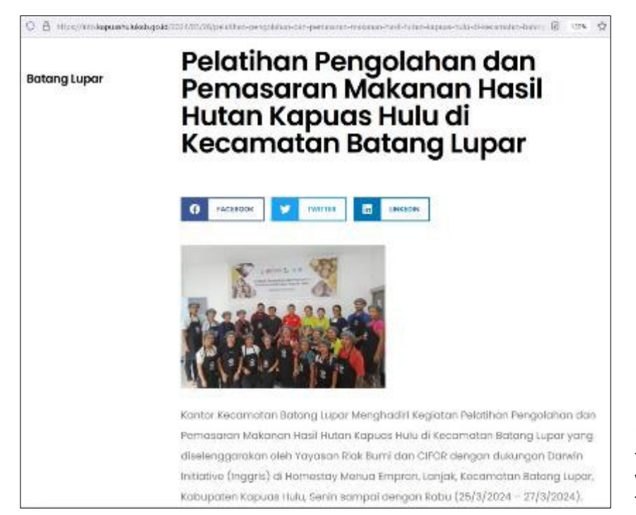
Fig 2. News about the training in the district's government website, acknowledging support from Darwin Initiative.

The Camat (Head of Sub-district) strongly supported this activity. He came to observe the training, talked with participants and discussed how to support the next steps e.g. to meet the government licensing procedure and to link with the district's economic development strategies. The Camat also posted the <u>information about the training in the district's website</u>.